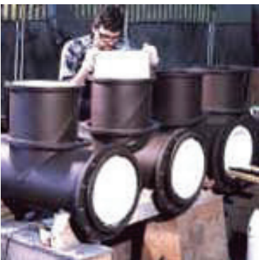
KALOCER® piping elements from Abresist Kalenborn can be placed with high performance adhesive.

Advantages: highly wear resistant, smooth surface that lasts, no corrosion, available from 1.5 mm thickness.