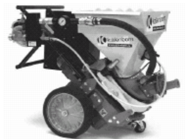
KALCRET®-S spray system