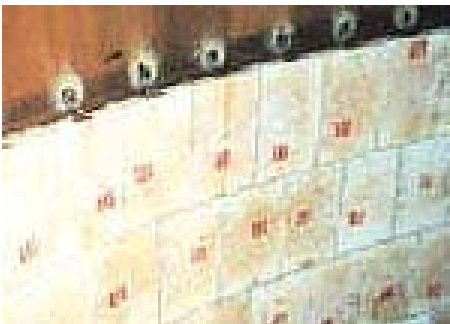
Left: High temperature wear protection in a dedusting cyclone of a blast furnace plant in Europe lined with KALCOR fused cast corundum made of alumina and zirconia.

Advantages: highly abrasion resistant, temperature resistant, corrosion resistant.